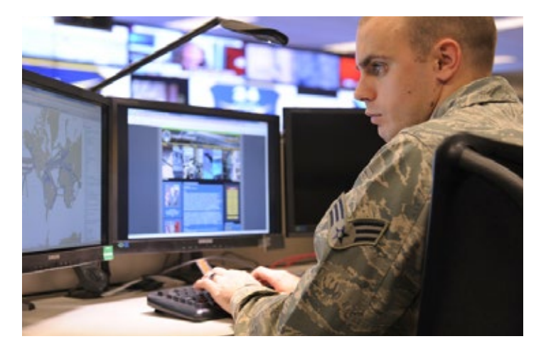
Over 1,000 cybersecurity professionals work on the Port campus, and numerous new operations have been established in recent months.