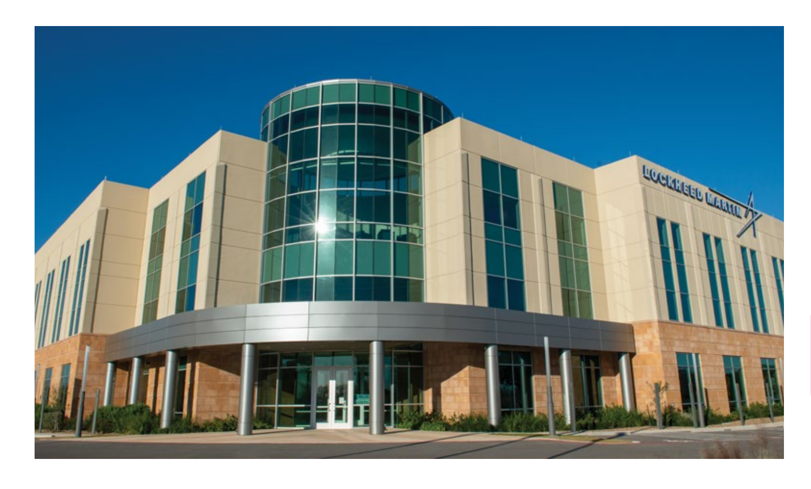
Project Tech Building 1 is a specialized office facility that supports expansions by cybersecurity and other advanced industries. The 90,000-square-foot building is the first phase of a mult-facility complex totaling over half a million square feet. (See #1)