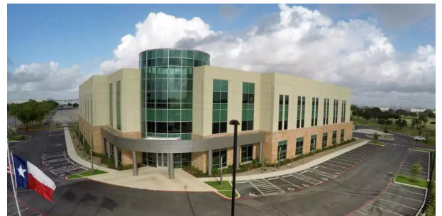
The Project Tech Building at Port San Antonio was quickly filled by cybersecurity companies, including defense contractors.