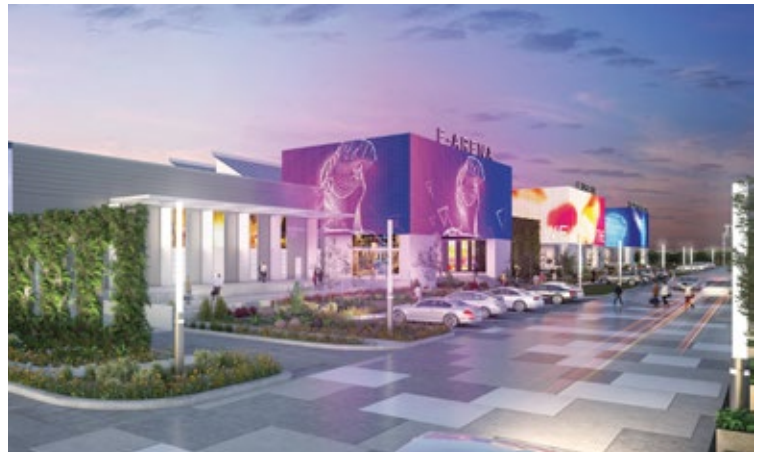
State-of-the-art multi-purpose building that includes co-working/maker spaces, technology arena/conference center, technology museum, industry showplace and amenities. (See #2)