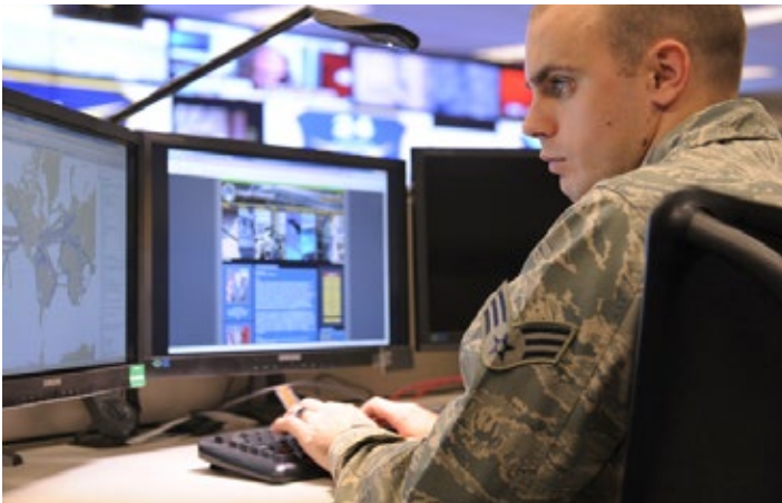
Over 1,000 cybersecurity professionals work on the Port campus, and numerous new operations have been established in recent months.