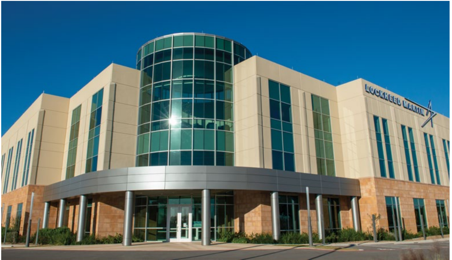
Project Tech Building 1 is a specialized office facility that supports expansions by cybersecurity and other advanced industries. The 90,000-square-foot building is the first phase of a multi-facility complex totaling over half a million square feet. (See #1)