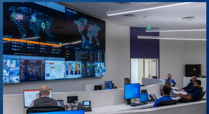
Alamo Regional Security Operations Center (ARSOC) strengthens around-the-clock collaboration between the city of San Antonio and CPS Energy information security personnel to safeguard the community's critical infrastructure against a growing threat environment.