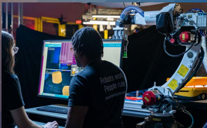
Plus One Robotics R&D laboratory.

SINCE LAUNCHING THIS VISION IN 2018, WE'VE CREATED OVER 8,000 NEW JOBS.