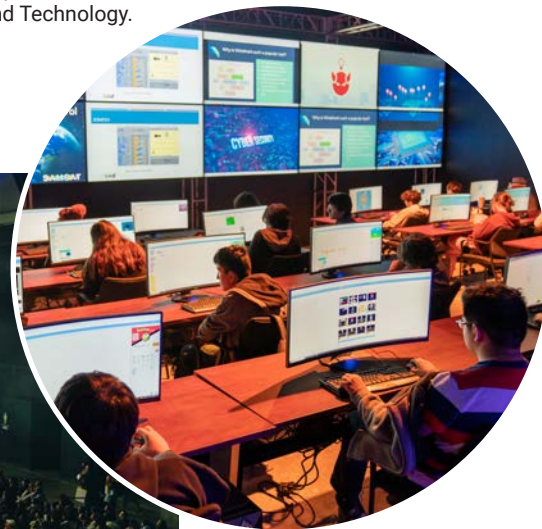
Above: The technology / esports arena at the Boeing Center at Tech Port.