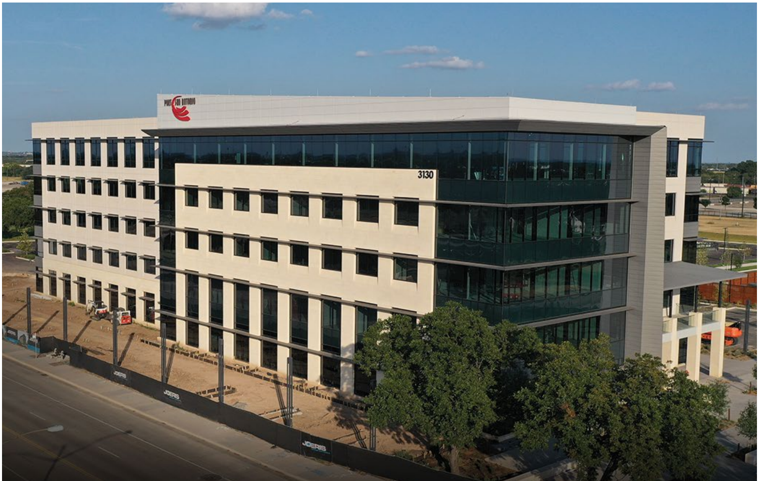
Project Tech Building 2 is a specialized office facility that supports expansions by cybersecurity and other advanced industries. The 174,000-square-foot building is the second phase of a multi-facility complex totaling over half a million square feet and will be completed in 2022. (See #1)