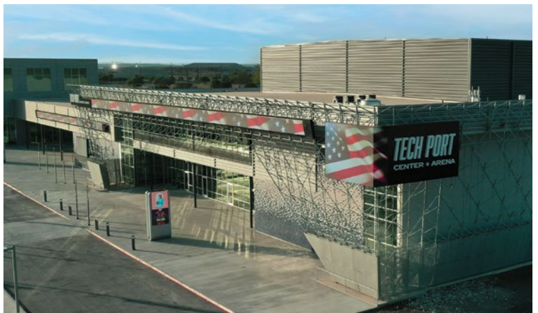
State-of-the-art Tech Port Center + Arena that includes co-working/maker spaces, technology arena/conference center, technology museum, industry showplace and amenities. (See #5)