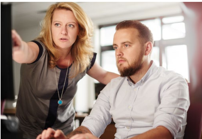
Nearly 2,000 cybersecurity professionals work on the Port campus, and numerous new operations have been established in recent months.