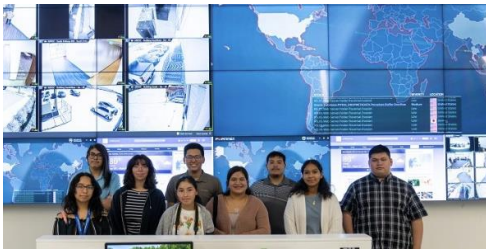
During their internship, students also had the opportunity to see first-hand several of the technology innovations being developed on the Port campus. This includes meeting with industry professionals in the aerospace, cybersecurity and space exploration sectors, such as the WEX Foundation (top), Knight Aerospace (middle) and the Alamo Regional Security Operations Center (ARSOC) (bottom).