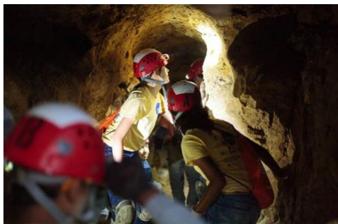
Since future colonies on the Moon will likely be built inside lunar caves that protect humans from radiation and other hazards, LCATS programs include visits and research activities in caves across South and Central Texas.

Along the way, students take part in expeditions to area caves to conduct research and experiments and also learn design skills and practical applications in the classroom and lab. Curricula include learning 3D printing technology and how it can be the basis of upcoming lunar construction by utilizing regolith minerals readily available on the Moon's surface. LCATS' learning experiences parallel much of the work that is being advanced in San Antonio by the WEX Foundation's affiliated commercial enterprise, Astroport Technologies.