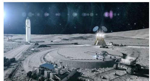
Rendering of what the early phases of a colony on the Moon might look like. In the foreground, robots are building a launch pad with bricks created by grinding, melting and re-shaping basaltic moon rocks.

Just days after the computer build program concluded, the San Antonio-based Dee Howard Foundation was the recipient of $150,000 to support an upcoming drone technology program which will be delivered at no cost to area middle and high school students during the 2023-24 school year.