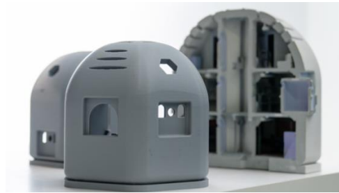
Scale models of future habitats on the Moon designed and created with three-dimensional building technology by young students participating in WEX Foundation programs are on display at the San Antonio Museum of Science and Technology.