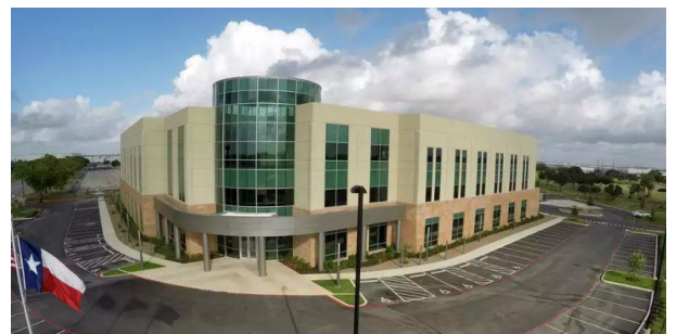
The Project Tech Building at Port San Antonio was quickly filled by cybersecurity companies, including defense contractors.