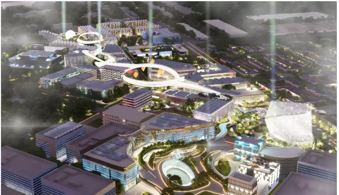
A conceptual rendering of a 16th Air Force campus being proposed at Port San Antonio and other nearby facilities. At far left, the existing Boeing Center at Tech Port can be seen, and at center right, in white is what it's now calling Innovation Tower, a new office building it's working to develop.

Though no one in the Pentagon asked, Port San Antonio wants to help the 16th Air Force find a new home to carry out its military cyber mission on the organization's Southwest Side industrial campus.