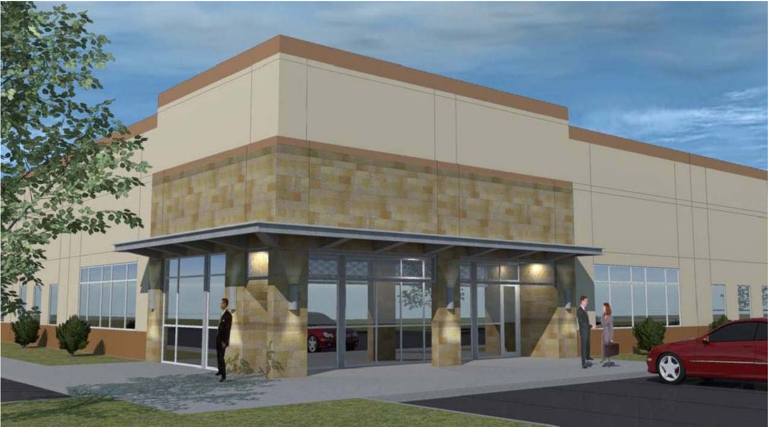
Perspective view may not represent final construction